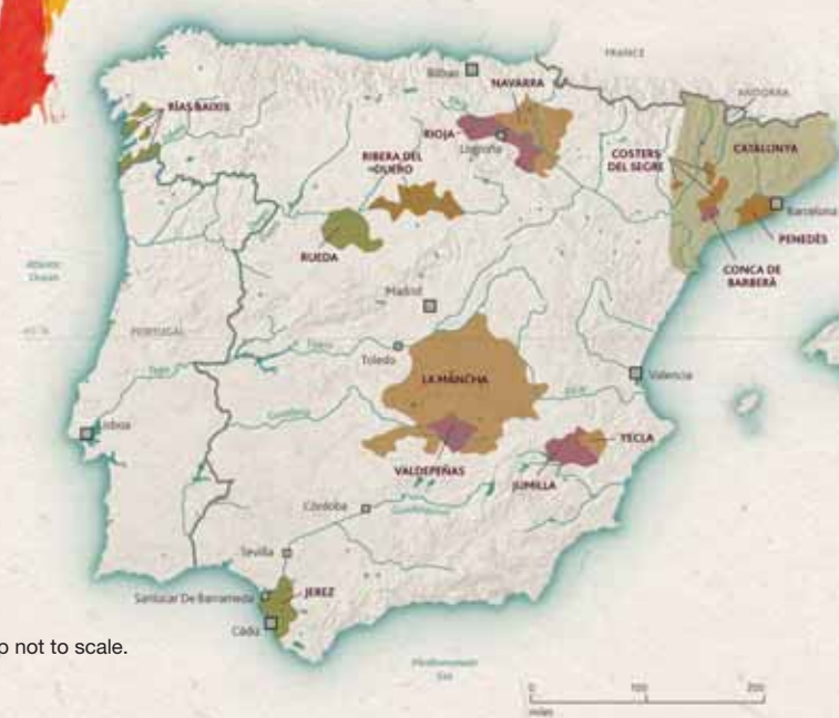
Map not to scale.

Grape variety is one of the most significant factors in the production of quality wines. Behind every wine, there is always